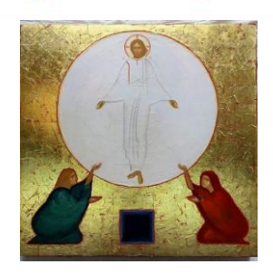
Newsletter 25th May 2023

Dear Everyone – Greetings, hoping you are all well.